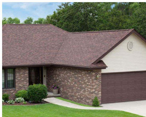
Figure 1 - Legacy® Scotchgard™