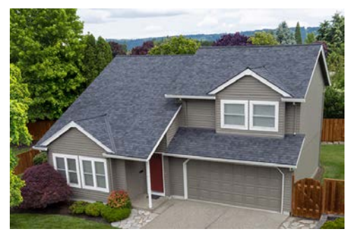
Figure 1 - Vista Shingles

Manufacturing Location: Portland, OR and Southgate, CA