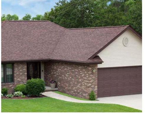
Figure 2 - Legacy Scotchgard

Manufacturing Location: Portland, OR; Southgate, CA; and Oklahoma City, OK