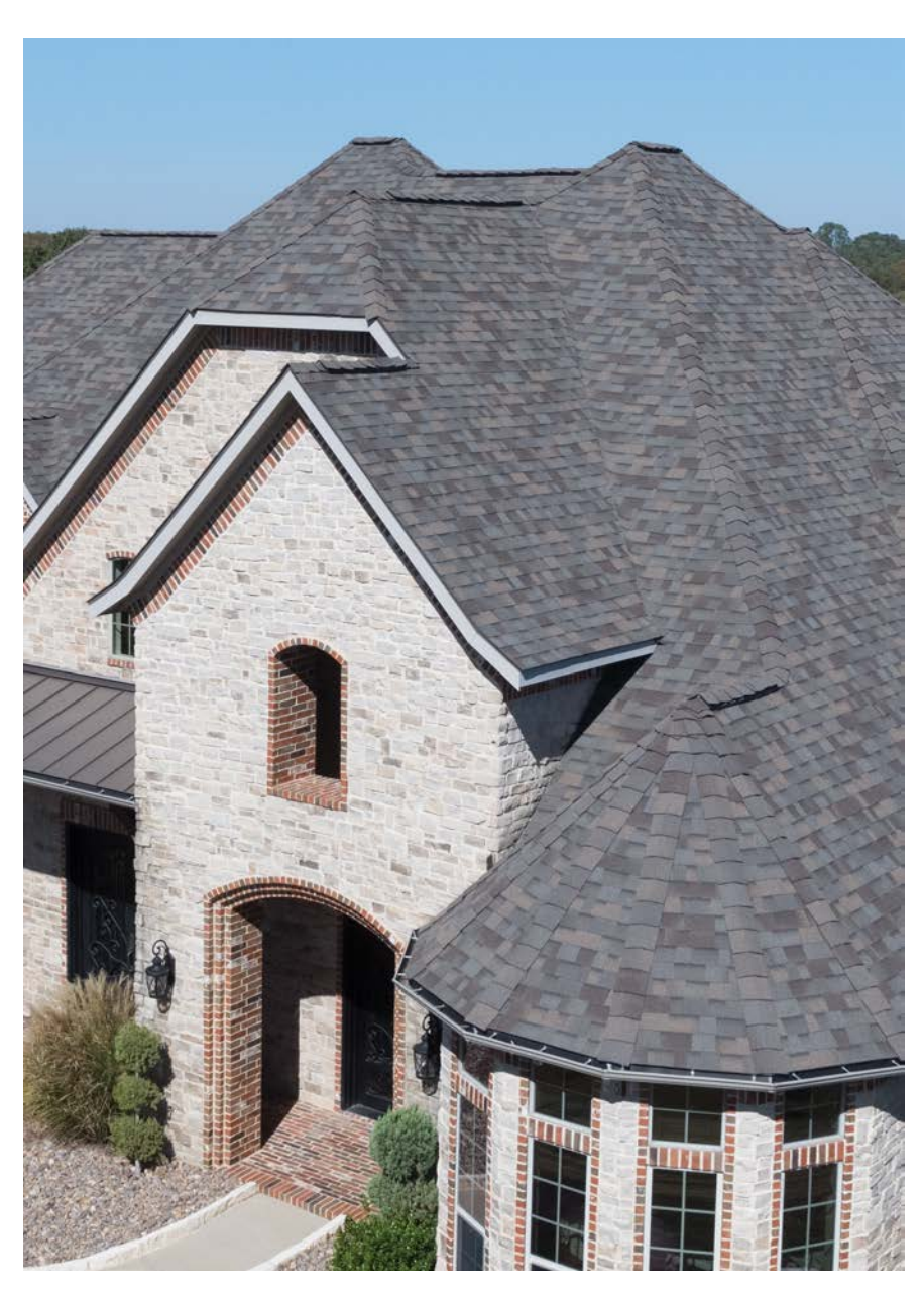
Legacy® is an architectural shingle line fortified with durable NEX® polymer modified asphalt technology to promote superior granule adhesion and extreme weather protection, including Class 4 impact resistance. This product line includes the optional Scotchgard™ Protector from 3M for added protection against black streaks caused by algae.

LEGACY® SHINGLES LEGACY® SCOTCHGARD™ SHINGLES