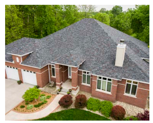
Figure 1 - Legacy Shingles