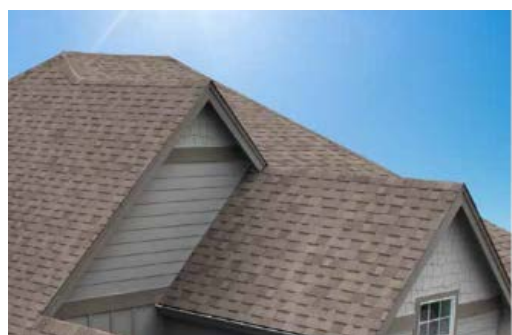
Figure 2 – Ecoasis™ Premium Shingles