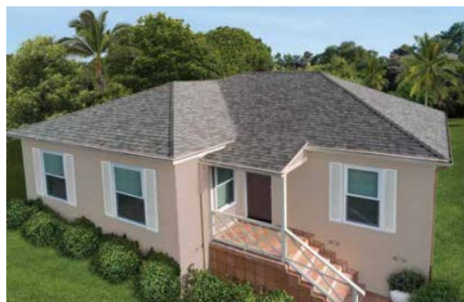
Figure 1 - Ecoasis™ NEX® Shingles