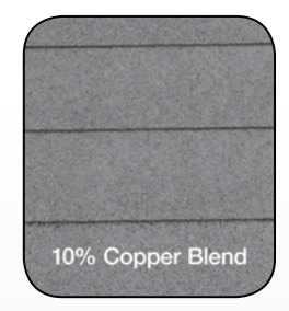
Grey scale images showing black streaks caused by algae growth on shingles exposed in Houston, TX for 5 years. Shingles with low blend percentages show significant discoloration already.