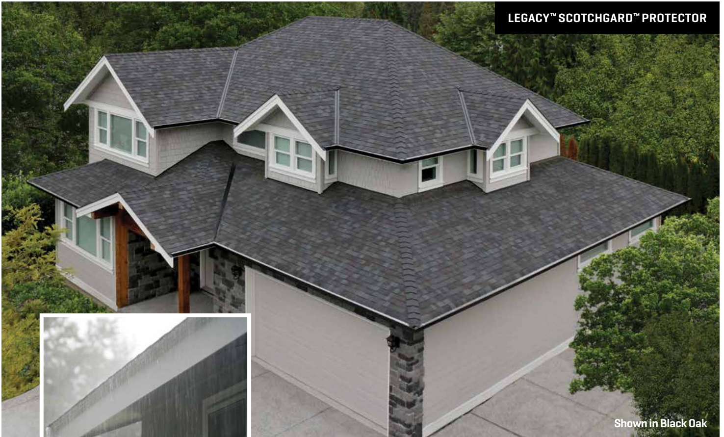
Shown in Black Oak